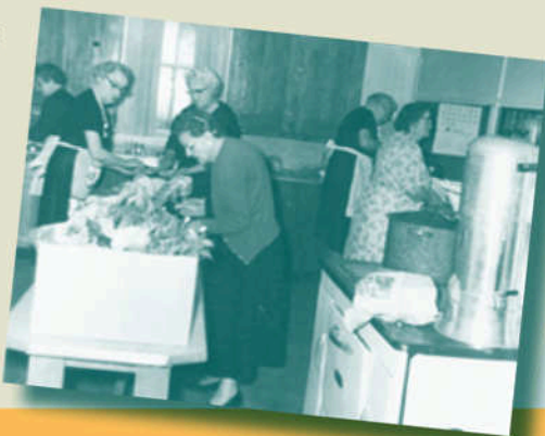
Trent Grange Kitchen, 1961

Although the Trent Grange is now silent and all but forgotten in an ever-changing world, the memories are safely kept in the Archive.