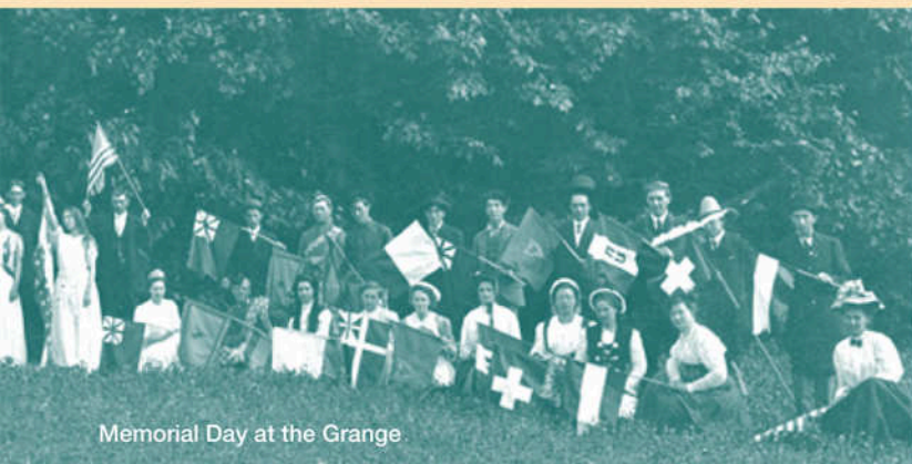
Memorial Day at the Grange

Do you know someone aged 16–22 who is in need of volunteer hours, is interested in working in the education field or is just curious about the museum? We have an opportunity for them! The Lakeshore Museum Center needs responsible young adults to act as counselors for our Enviroworks Day Camp. Volunteers can participate for one or both weeks of the camp, which runs July 18–22 and July 25–29. Counselors must be available from 8:45 am–12:15 pm each day of their chosen week(s) and must also attend a mandatory volunteer training session on July 6 from 9–11 am. If interested, please call Jackie Huss, Associate Curator of Education, at 231-722-0278 to register.